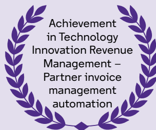
Awarded by 2023 Bronze Stevie Award