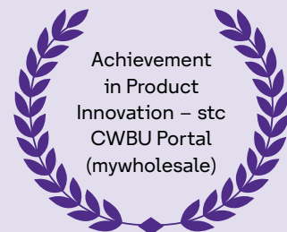
Awarded by 2023 Bronze Stevie Award