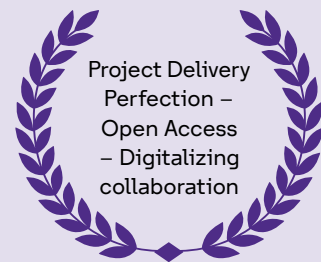
Awarded by 2023 Glotel Awards