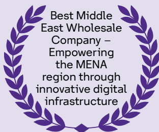
Awarded by 2023 Telecom Review Awards