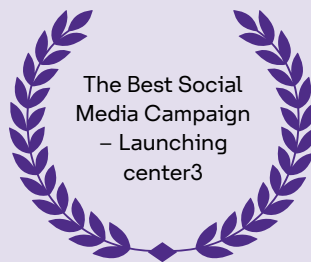
Awarded by Global Carrier Awards 2023